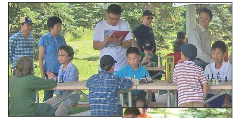
Chess Picnic scenes from 2011