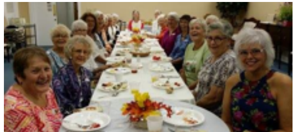
Rose Circle September Meeting