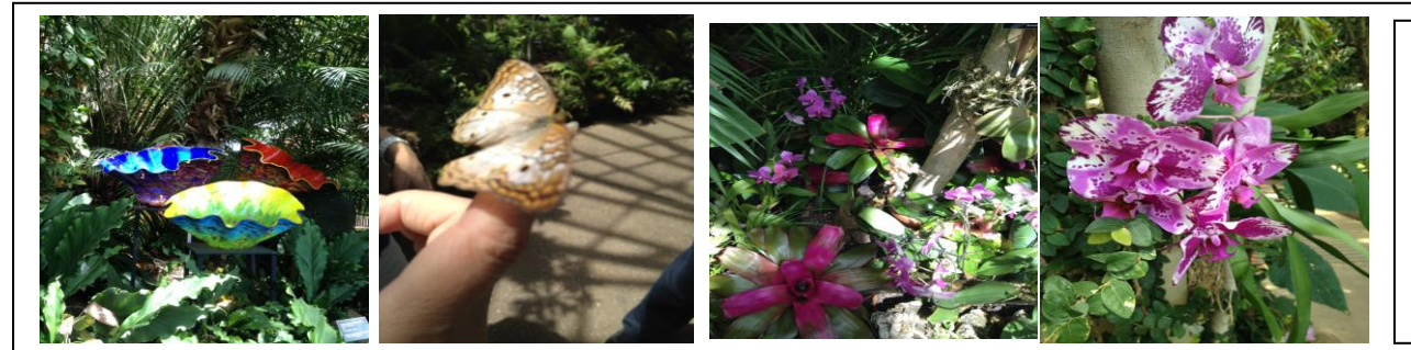
Chase away the winter blues with a visit to Phipps Conservatory in Oakland! It's a taste of the Tropics in Pittsburgh!