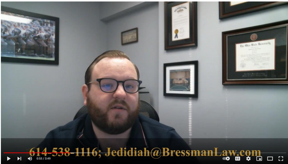
Ohio Injury Attorney Answers: I have gone to the ER, what should I do now?