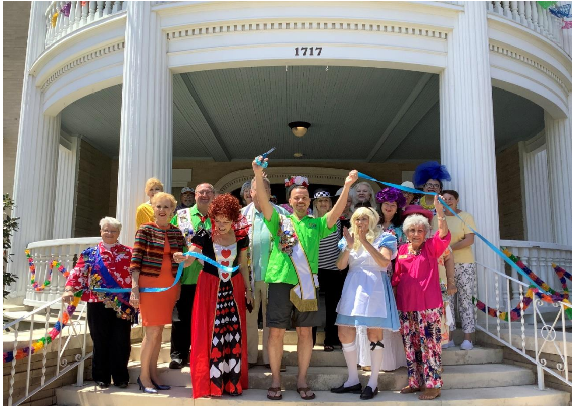
Fiesta Flower Show Ribbon Cutting, April 1, 2022

The Fiesta Hat Show was also a sell-out crowd. The ballroom was at capacity. The silent auction headed by Ginger Vlieger, the raffle headed by Trace Mahbubani, the boutique headed by Angela Pfeiffer,