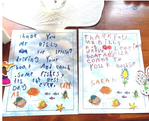
Thank you notes from the children who joined us for our annual Edmarc Weekend this last month for terminally ill children and their families