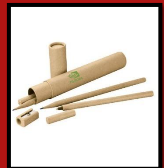
Eco Friendly Pen & Pencil Set