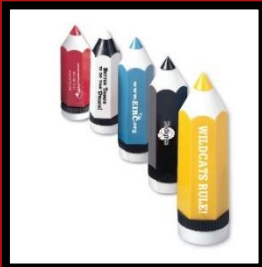
Pencil Shaped Sharpener