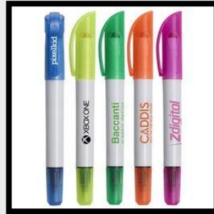
Pacific Gel Highlighter Pen