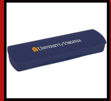
School Supply Case