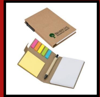
Recycled Pen, Note & Flag Set