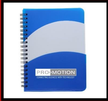
Double Pocket Notebook

Contact our Customer Service Department for Pricing & Additional Products