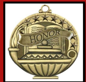
2" Academic Medal HONOR