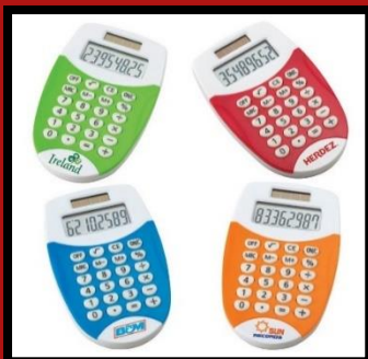
Dual Powered Pocket Calculator