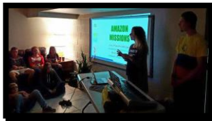
SHARING IN ONTARIO

Reaching the far corners of North America from Miami, Ontario, Vancouver, Los Angeles and back, we travelled 23 500 km in 2.5 months ardently admonishing Believers at over 40 venues, throughout Canada/ USA, to regain their fervor for the Great Commission of JESUS CHRIST. Heb 10:32 – 36, But remember the former days, when, after being enlightened, you endured a great conflict of sufferings, ... For you have need of endurance, so that when you have done the will of God, you may receive what was promised. We were also privileged to see the replica of Noah's Ark in Kentucky, USA. We also did presentations in many other cities and towns in between campaigning for God's Kingdom.