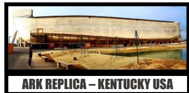
ARK REPLICA - KENTUCKY USA

Testimonies of people who went to Heaven and Hell www.divinerevelations.info