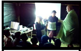
JESUS CRUCIFIX DRAMA

What a joy after so many years to see the fruit of the first impact in this area, having taken root producing many results as these tribes now are strong communities, devoid of carousing etc., which we previously encountered. Herewith we returned on our route and were fortunate to even fly some of the distance back to the big city. Praise God for such another great expedition with much fruit.