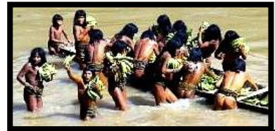
BANANA GIFT AT CONTACT

This time, we shared a lot in the form of drama/ music to the tribe. After we prayed for the sick, many were first healed, then saved, baptized and received Bibles as some could already read and write. Then we returned to our jungle town, and we set off to our last tribe, up a larger river. We shared a mighty service, where 7 years ago, for the first time there, we had a group of 24 students from Potchefstroom University, who aided in a very successful outreach. Many were saved and touched at that time, only after half of the student group themselves, made full commitments to JESUS CHRIST as Lord, all of us repenting, humbling ourselves before the Lord, the rest getting baptized, and speaking in tongues.