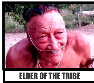
ELDER OF THE TRIBE