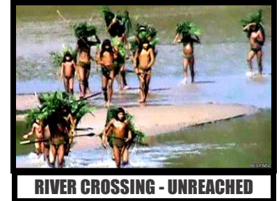
RIVER CROSSING - UNREACHED