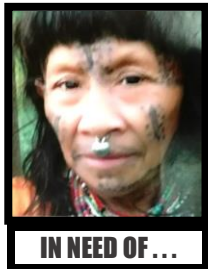
IN NEED OF...

(Follow these journeys - www.facebook.com/amazonmissions100 )