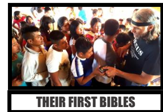
THEIR FIRST BIBLES