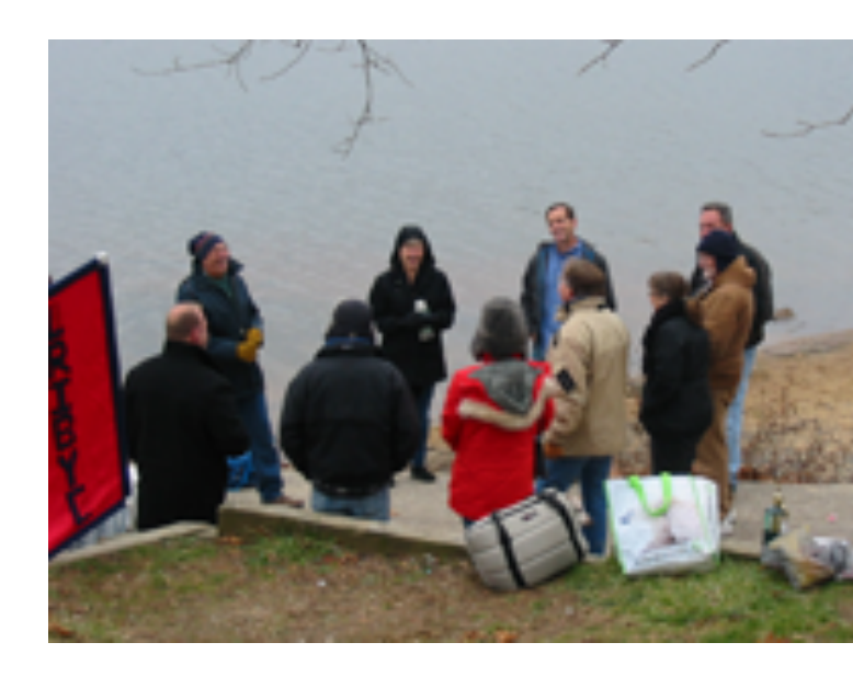
Seeding the Lake - Winter Solstice - LRIBYC