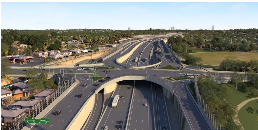
Artist's Impression of North East Link / Grimshaw Street interchange

Initiating an independent Safe System Assessment ensures the project maximises alignment with Safe System principles, meets the Victorian Government's commitment to undertaking Safe System Assessments for all major road projects and confirms the North East Link Authority's commitment to building a world class road that provides safe travel for all road users.