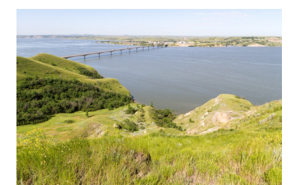
Beautiful Lake Sakakawea, right in New Town's back yard!

There are only eight more weeks left of summer. Enjoy the outdoors and be safe!