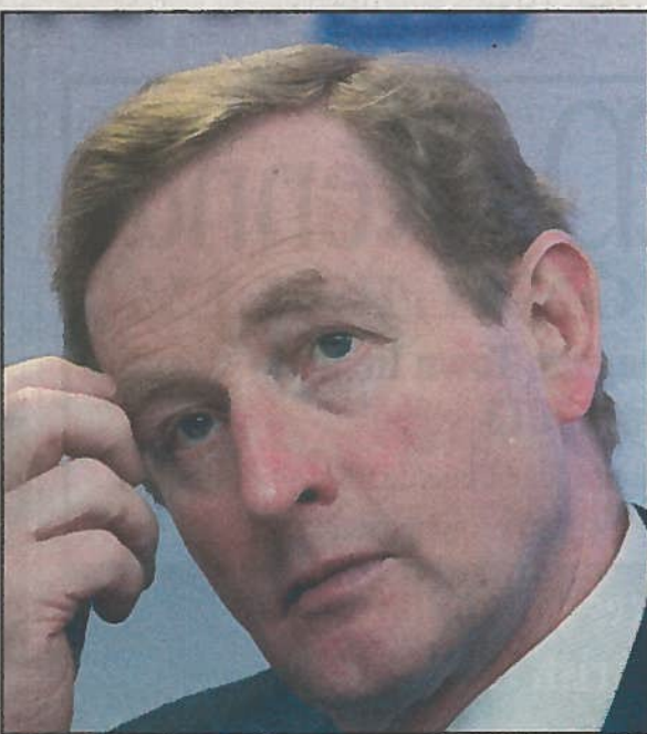
Taoiseach Enda Kenny.

Cardinal O'Malley to boycott Kenny and BC speech