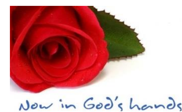
By God's Grace, heirs of the hope of eternal life. Titus 3:7

Those planning on making memorial contributions are asked to please consider Trinity United Church of Christ or Harris-Elmore E.M.S.