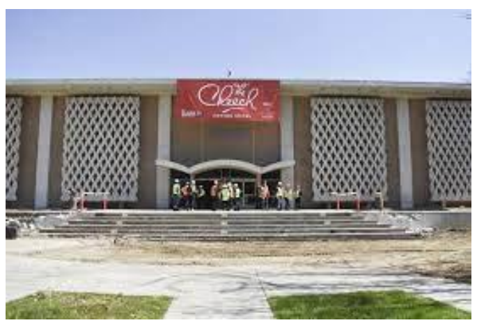
The Riverside Library is transformed into the Cheech Marin Museum for Chicano Art

Both events are sponsored by the LVHS and La Verne's Cultural and Social Inclusion Committee.