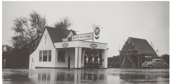
The auto in the background appears to be a late 1930s—early 1940s Chrysler product (Dodge,