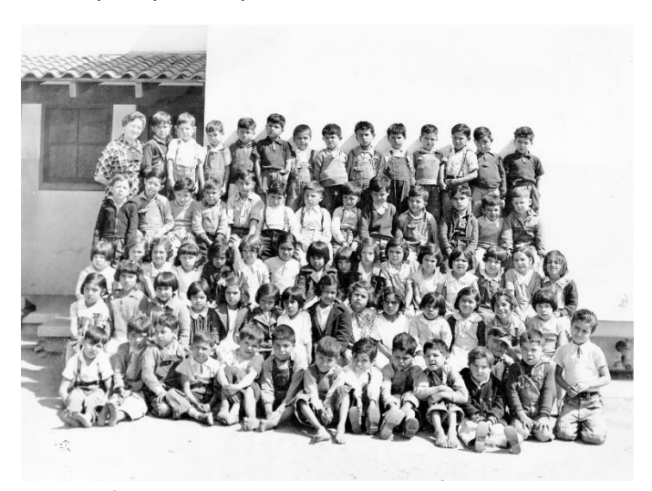
A class of children poses with their teacher at the Palomares School; note the number of children in this single class!

Lincoln School, built on "D" Street in 1906, served all elementary students of Lordsburg/La Verne, both those of Anglo and those of Mexican descent, until 1927. In 1926 the School Board had a second school built at the corner of "A" Street and Palomares (now Arrow Highway) for children of "the Mexican colony" south of the Santa Fe track. The "American" children would all go to Lincoln. The La Verne Leader referred to the policy as 'sequestration'.