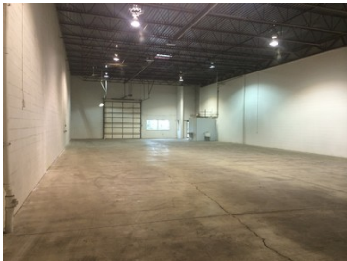
27225 Northline (9)