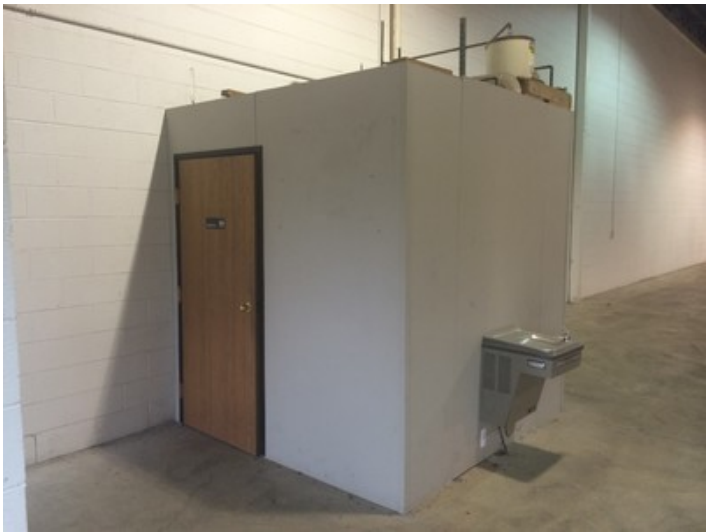
27225 Northline (7)