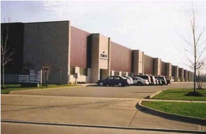
Taylor Trade Center 3&4 (2)