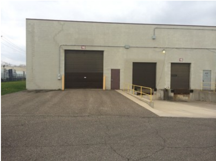
27225 Northline (10)