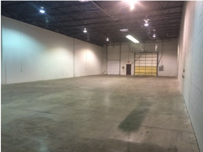
27225 Northline (8)