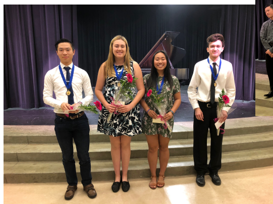
Senior Medallion Recipients