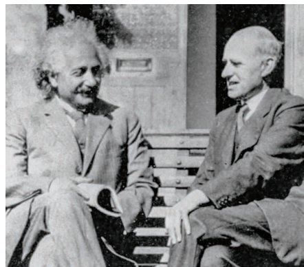
Eddington's (right) 1919 eclipse observation confirmed Einstein's (left) theory of relativity.