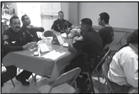
First responder guests at Arcadia Post 247

El Monte Post 261 invited law enforcement and fire personnel from El Monte Police and Fire stations into the Post for lunch.