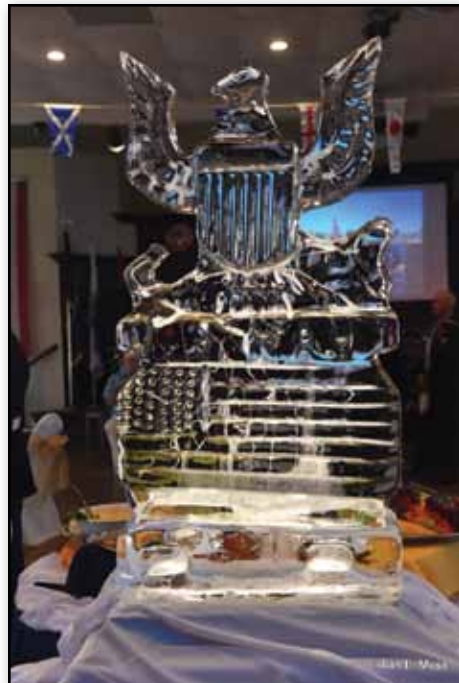
Ice Sculpture.