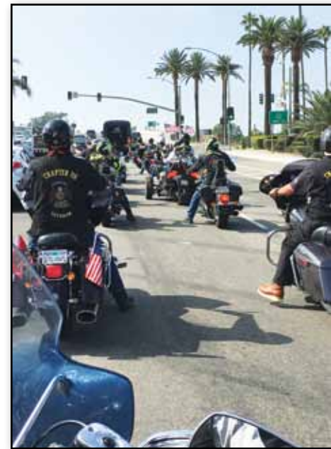
Legion Rider escort for 2015 Silver Rose honorees.

If you would like to learn more about the Legion of the Silver Rose, be part of it, or donate to the Legion of the Silver Rose,