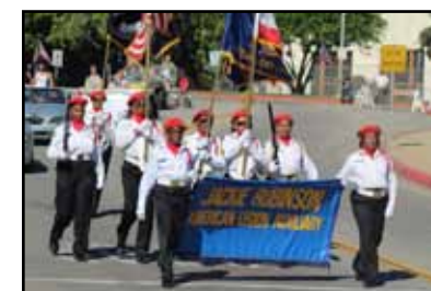
Award winning Jackie Robinson American Legion Auxiliary Color Guard Unit 252

and The American Legion, Department of California, to replicate this historic event.