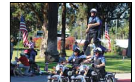
World Champion Stunt & Drill Team, Victor McLaglen Motor Corps, entertained audience near the review stand prior to start of the parade

Following the Parade, a Veterans Day Resource Fair was held on the VA grounds. Special thanks to VA Greater Los Angeles Healthcare System and all those who worked throughout the year to make this event a success.