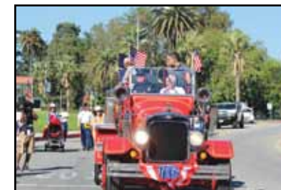
Grand Marshal, Tommy Lasorda (front right)

The first “America’s Parade: L.A.” was held on Veterans Day, November 11, 2016, on the grounds of West Los Angeles VA Medical Center. America’s Parade originated in New York. The New York-based United War Veterans Council partnered with the Los Angeles County Department of Military and Veterans Affairs