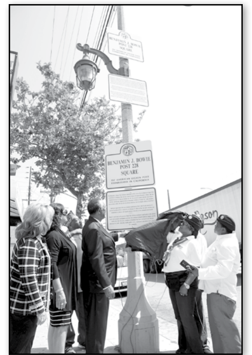
L.A. City Councilman, Curren Price Jr., dedicates Benjamin J. Bowie Post 228 Square

The intersection of 51st Street and Central Avenue in Los Angeles was dedicated as the "Benjamin J. Bowie Post 228 Square" on June 2, 2016 by City Councilman Curren D. Price Jr. This honor was bestowed on Post 228 for its many contributions to the community as well as pays tribute to the many servicemen and women of