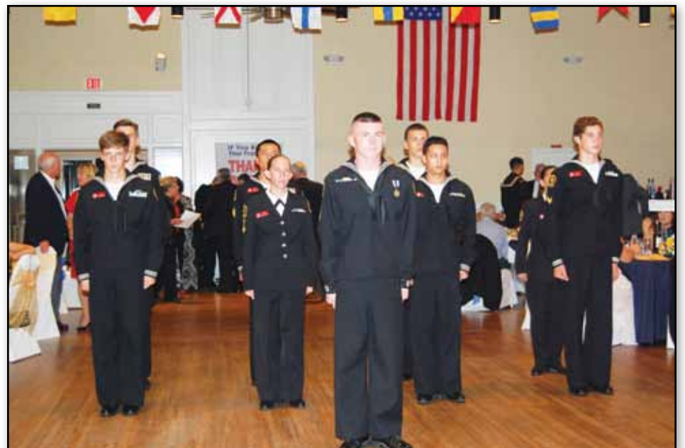
NSCC El Toro Battalion Sea Cadets standing at attention.