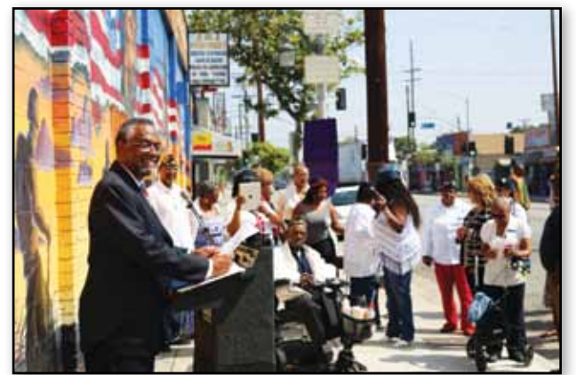
L.A. City Councilman, Curren Price Jr., addressing members of Benjamin J. Bowie Post 228 and members of the community during the dedication of Benjamin J. Bowie Post 228 Square and unveiling of a mural, "Penta-Loom: Ode to Soldiers" on June 2, 2016

The Benjamin J. Bowie Post 228 Drum and Bugle Corps was, for many years the only jazz drum and bugle corps in the world. One of its'