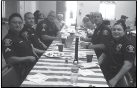
El Monte Post 261 Family's guests

Arcadia Post 247 invited law enforcement and fire personnel into the Post for breakfast, serving 10 first responders and then delivering 107 meals to stations in Arcadia, Duarte, Monrovia and Temple City.