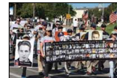
Honoring Hollywood Stars who served during World War II

On hand was NBC4 Southern California to provide free coffee, snacks, and interview veterans.