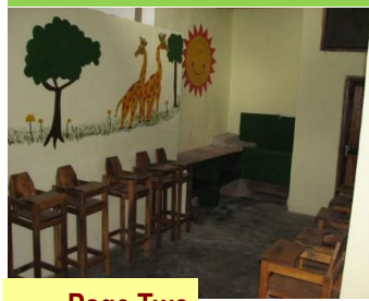
Below are pics of the baby house ready for babies