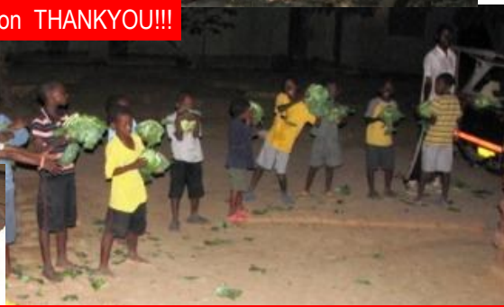
Some of our small boys unloading 100 cabbages