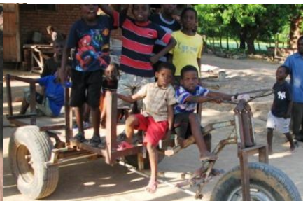
Rebuilt pushcart for children play and staff use complete with Don's barke invention !!! WOW