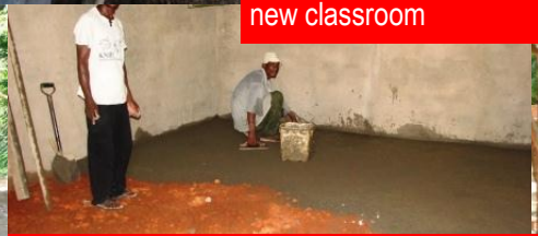
Concrete floor in our new classroom, (part of carpenter shop)