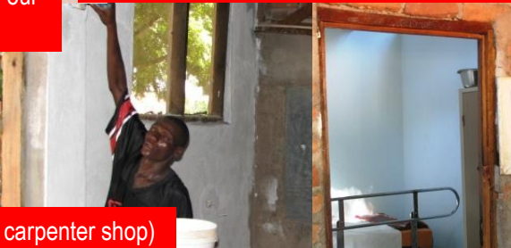
Rebuild and paint our clinic room ThkU