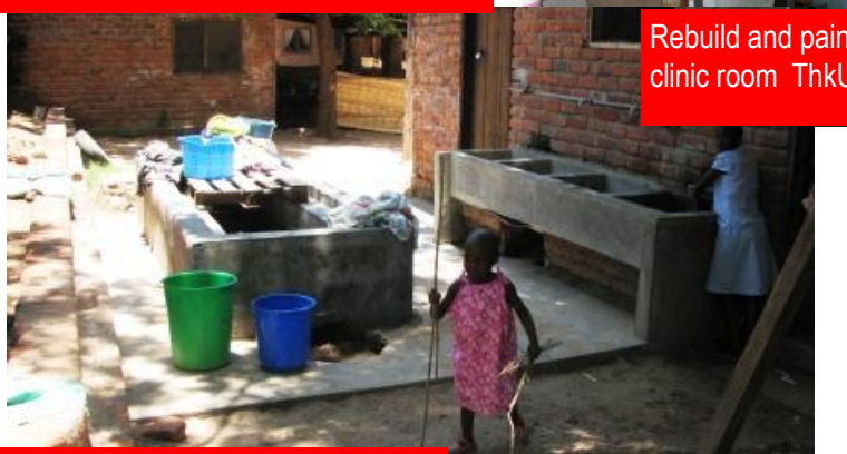
New Laundry Station THANKYOU!!!