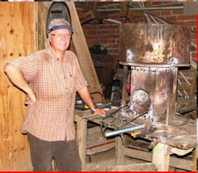
Don REBUILDING our cook stoves