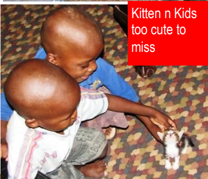
Kitten n Kids too cute to miss