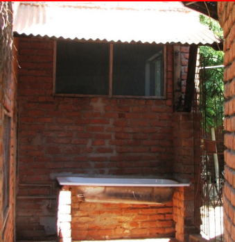
Outdoor tub for babies