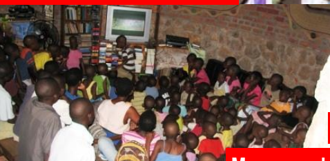
YOUR SUPPORT HAS ALLOWED ALL OF THIS \O/