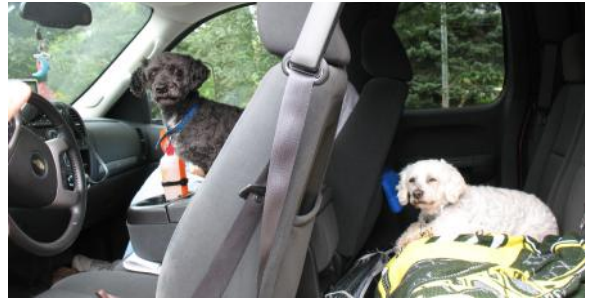
Oreo in the front, Davenport in the back.