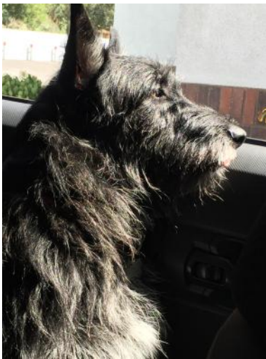
Brooks, now living in Southern CA