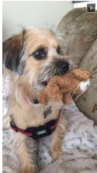
Versache. One of a litter I will never forget.