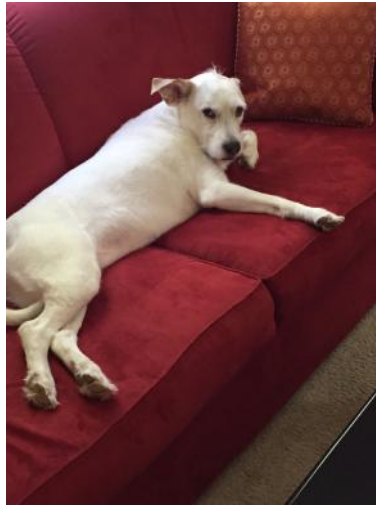
Emma recovering from her eye surgery.

My son adopted Benny from Fluffy Dog, Hartland, WI, and we adopted Katie almost 4 months ago from Hartland. I can't imagine not having Katie or Benny in our lives. Katie has brought my husband and I so much happiness and joy! Thank you so much for rescuing these dogs!!