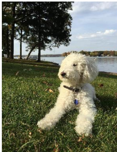
Tori, one of our 20 Klein poodles