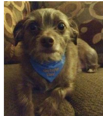
Splinter on Gottcha Day