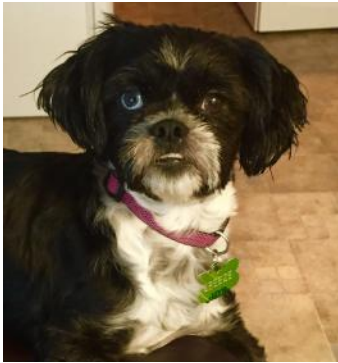
Breeze, mom to the beach pups.