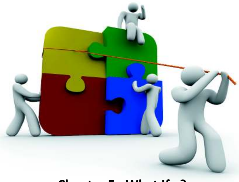
Chapter 5: What If ...?

This chapter is devoted to additional questions about IEPs that are regularly posed to P&A advocates.