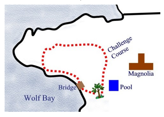
Follow the dotted line and look for numbered markers along the trail.