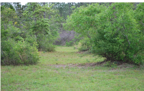
In the beginning God created the heavens and the earth...And God said, "Let the land produce vegetation: seed bearing plants and trees on the land bear fruit with seed in it, according to their various kinds." And it was so. The land produced vegetation: plants bearing seed according to their kinds and trees bearing fruit with seed in it according to their kinds. And God saw that it was good. Genesis 1:1. 1:11-12 NIV