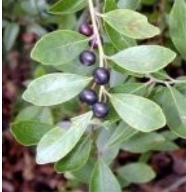
lands & swamps. It is

The red maple is also known as scarlet maple and swamp maple. It is easily recognized in the fall when the red leaves stand out along the forest edges along roads and along riverbanks