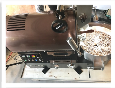
BC-3 HAS TWO 76MM (3") EXHAUST PIPES

THE BC-3 MD IS A HEAVY DUTY ROASTER BUILT WITH A CARBON STEEL BODY WITH APPROVED POWDER COAT HIGH TEMPERATURE BODY IN BLACK. THE HOUSINGS COME IN A CHOICE OF 4 COLORS (Gold, Rose Gold, Black Titanium & Stainless) In two type finishes (MIRROR or MATTE) TWO EXHAUST PIPES COMES OFF THE BC-3 AT 3" AS SHOWN BELOW AND CAN BEEEXHAUSTED OUT OF BUILDING SEPARATELY OR CONNECTED WITH A BLAST OR BACKDRAFT DAMPE