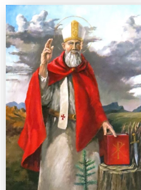
Feast Day: June 5