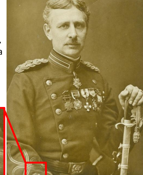
Continued on page two

This insignia was worn by battalion or regimental quartermasters. The regulation allowed for pin-on insignia, like the photo above, or embroidered insignia, like in the photo below. This insignia would have been worn on the cuff of a dress uniform.