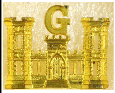
Gilt Engineer hat badge.

This acquisition also contained a hat badge, worn by a member of G Company. Although this size insignia was authorized in 1896, G Company was not activated until 1901. In 1905 the insignia was reduced in size.