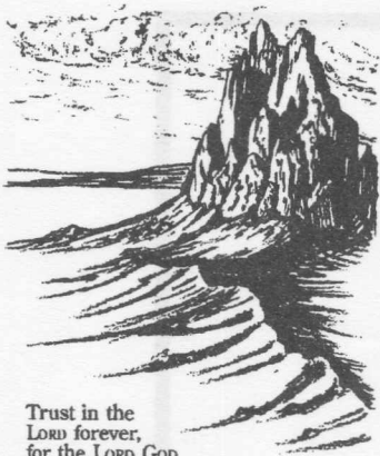
Trust in the LORD forever, for the LORD GOD is an everlasting rock. -Isaiah 26:4