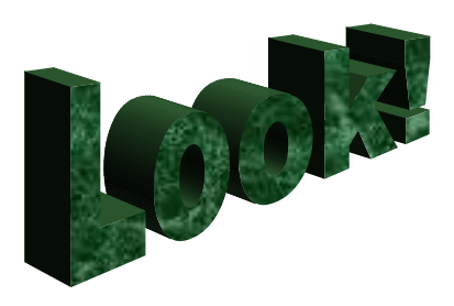
Find us on Facebook at <a href="http://www.facebook.com/epclepc.generalconference">http://www.facebook.com/epclepc.generalconference</a>

Holy Spirit Lutheran Church Arkansas 870-431-8521/870-421-5516