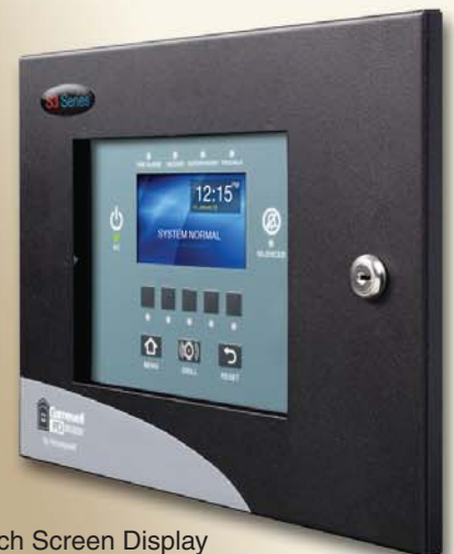
Touch Screen Display for Optimal Annunciation