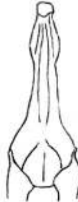
Neck Ventral View