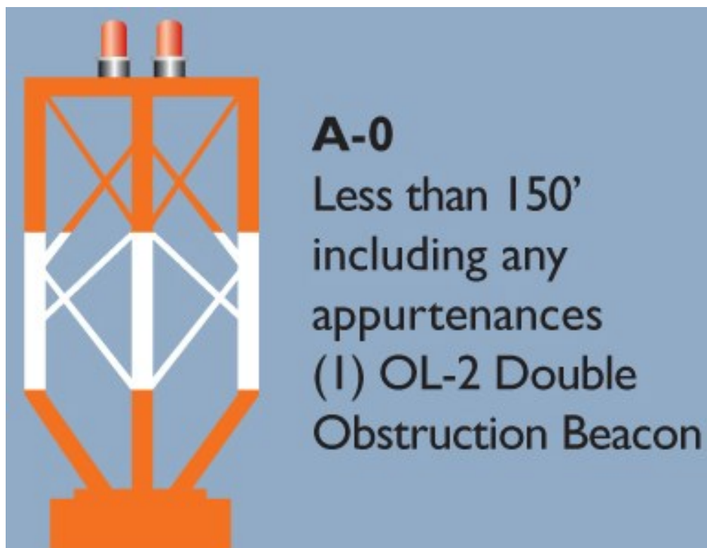
Diagram from FAA Advisory Circular AC 70/7460-1K Change 2, A1-18. The FAA determination of no hazard for these towers are: Chapters 2, 3, 4, 5, 12

These guidelines are for reference only. Please contact Flash for specific questions regarding obstruction marking.