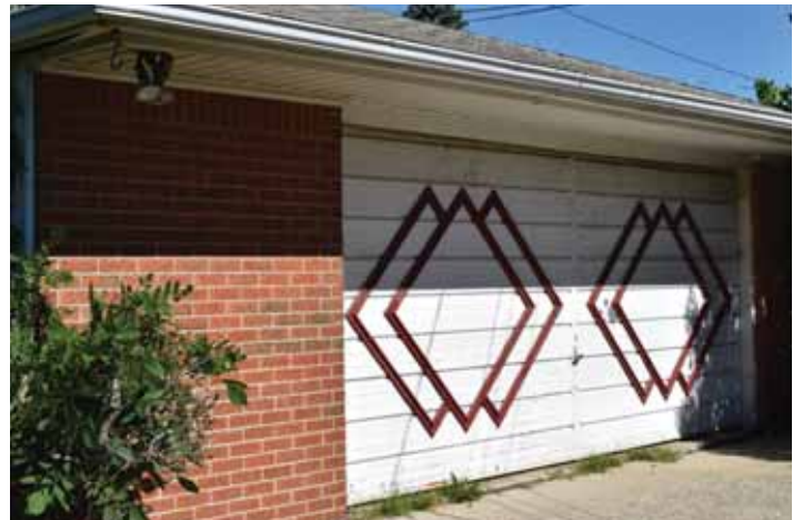
2 car garage

Closing: in 90 days, with Probate Court Approval.