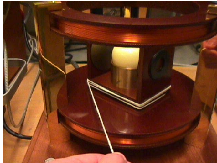
Figure 4: The String-Pull Method and the rotating, transverse-field, device.

A variation of the String-Pull method can also be used to facilitate the rotation of the transverse magnetic field accessory, as shown in Figure 4.