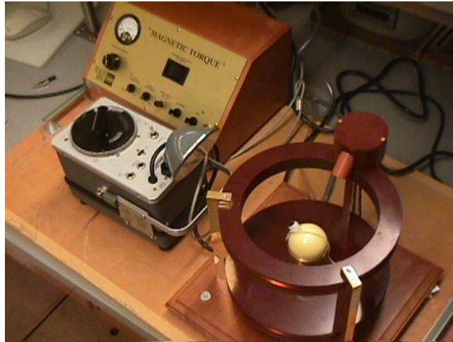
Figure 2: Experimental Setup with Secondary Strobe Light

f_{st} , the white dot will appear to go out of and then back into coherence with the strobe as ball spin slows down.