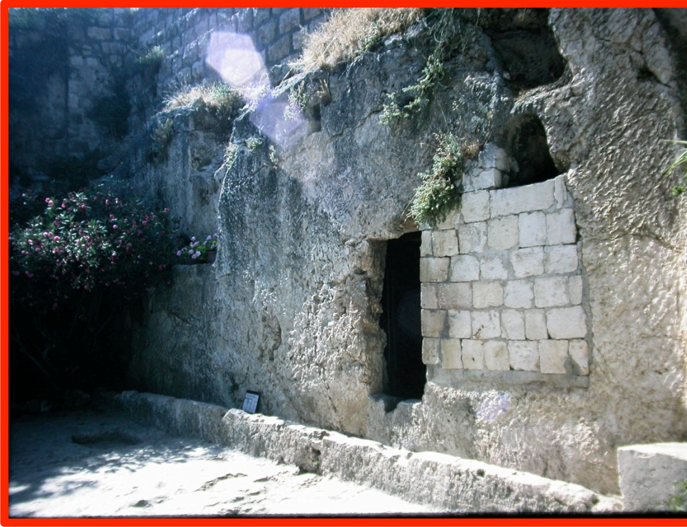
Garden Tomb (JRT)

Romans 4.25 Jesus was crucified for our sins and raised for our justification