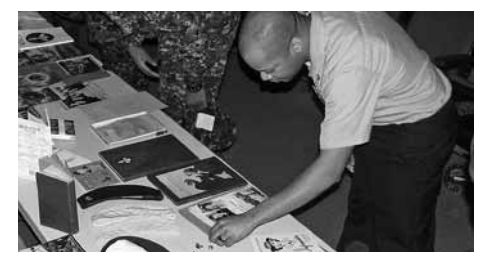
TSC sailors look over display of memorabilia at the Women's History Month presentation.

The Tidewater Tidal WAVES, Unit 152, experienced an exciting month during Women's History Month with nine invitations to talk to the sailors of today "the good old days!" We were so busy that our presentations actually extended into April!