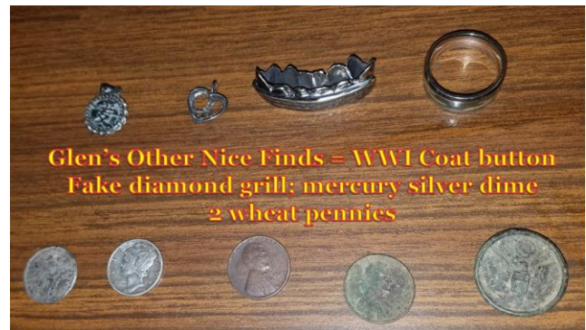
Glen's Other Nice Finds = WWI Coat button Fake diamond grill; mercury silver dime 2 wheat pennies