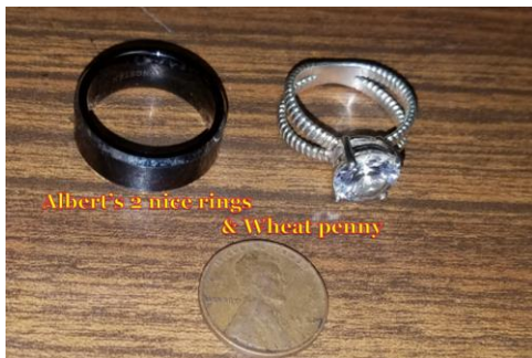
Albert's 2 nice rings & Wheat penny