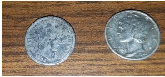
Find of the Month - Coin: Glen = 1902 Barber dime