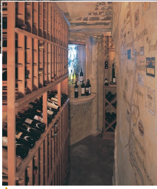
The wine cellar, which was artistically constructed beneath the home's main staircase, appears to actually be below ground in a centuries-old building.

The lanai enjoys a view of the pool with its pergola over the bar area, as well as the lake behind the home.