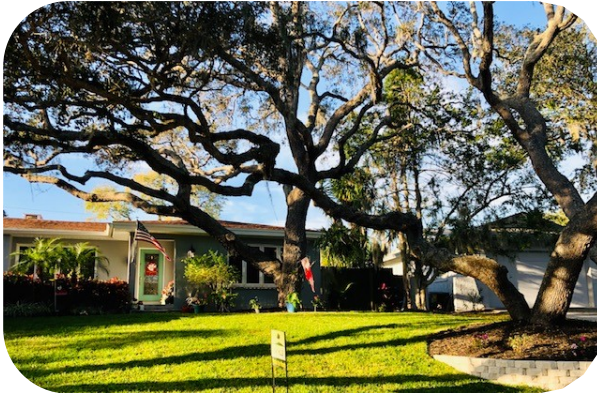
Refreshed lawn & tree edging on Tanglewood

Bay Hills Homeowners Association, Inc., PO Box 624, Indian Rocks Beach, FL 33785 Incorporated 1974 www.BayHillsFL.com