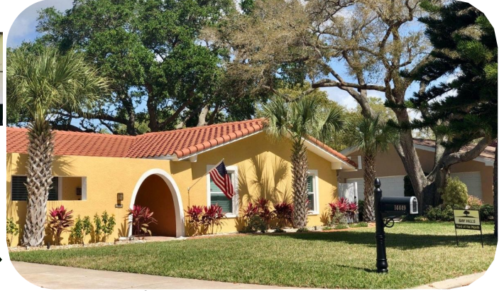
Nice blend of tropicals with signature Bay Hills oaks