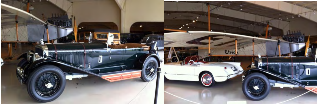
A Bentley with a 1913 Etrich Traub behind it and an old Corvette Have you ever heard of an Etrich Traub?