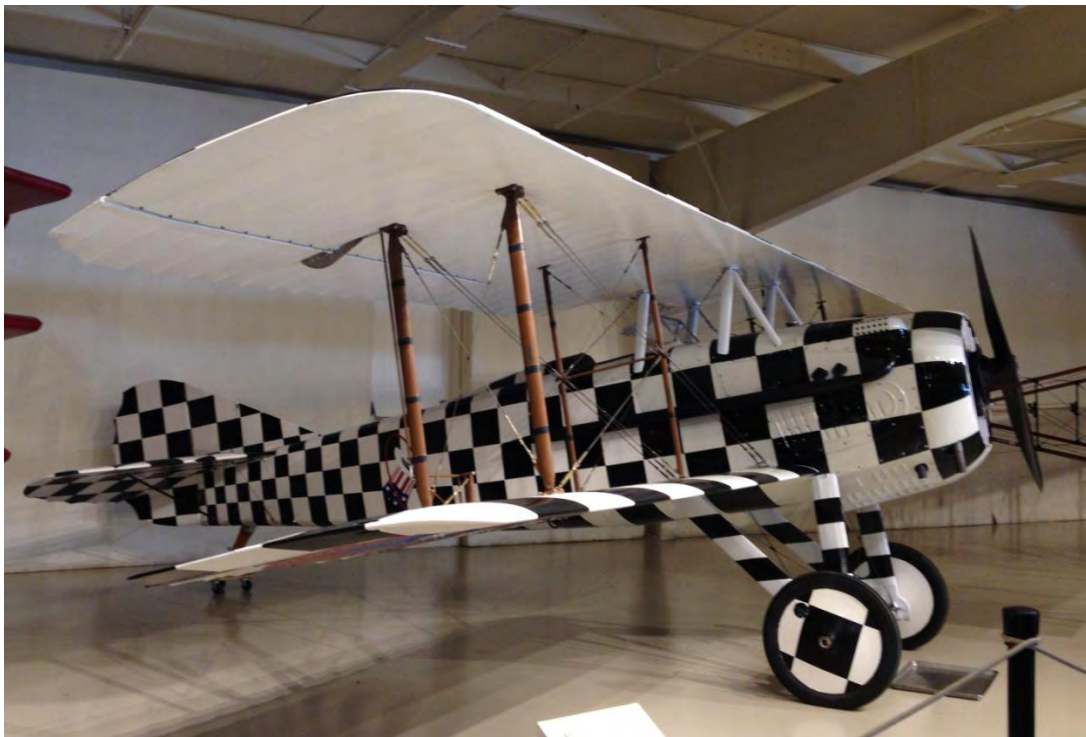
1917 SPAD XIII.C.I

The following picture is of Donna's favorite airplane in the exhibit. She really liked the paint scheme. It is an exact replica of the paint scheme on the aircraft flown in WWI. Just beautiful.