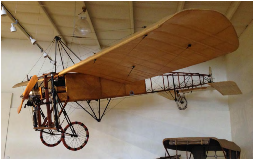
How about a Bleriot?

This replica was built and flown for a 1958 movie, The Lafayette Escadrille . The aircraft was fitted by an authentic 3 cylinder Anzani Engine by the museum.