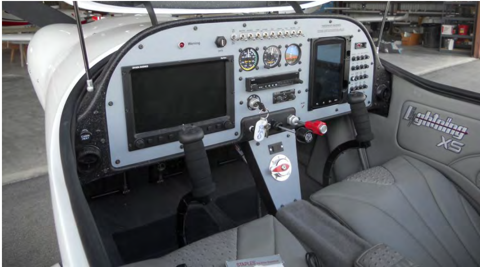
N320XS cockpit with a Dynon SkyView.

The June flights in N320XS were on very hot and humid days. At the Shelbyville Airport, with an elevation of 801 feet, the surface temperature for the all flights was between 89 and 93 degrees F. The surface density altitude (DA) varied between 2600 to 2900 feet. Definitely not a standard atmospheric day, but the XS performed amazingly.