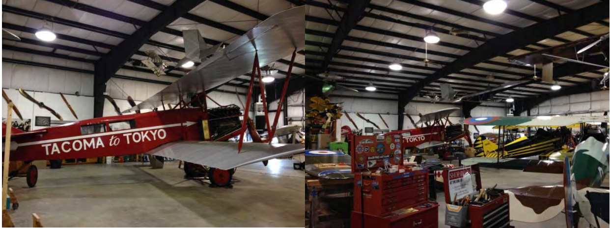
A 1923 Fokker C.IV. and the Hangar