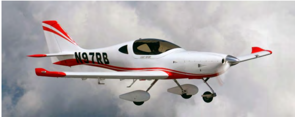
Lightning S-LSA for Sale!

This is a 2012 factory built S-LSA, 60 hours total time, Dynon Skyview 10" EFIS with autopilot, Mode S transponder, Garmin SL40 radio, Garmin Aera 796 with XM weather, Retractable sunshade, MK2 tail, all the good stuff.