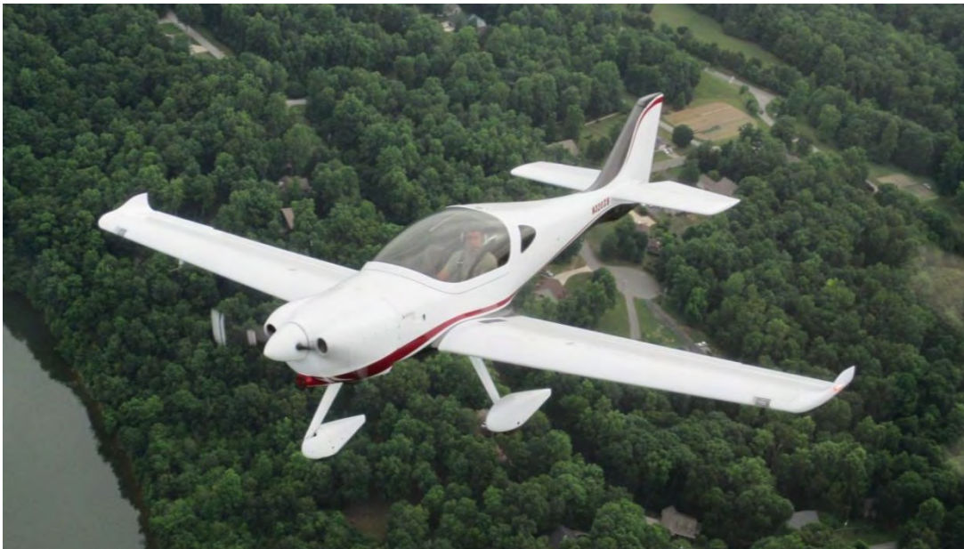
N320 XS, the 160 HP Lycoming O-320 powered Lightning.

I recently had another chance to fly Arion’s latest development aircraft, Lightning N320XS. I had first flown this new higher powered (more cubic inches and more horse power) Lightning in late March 2014, just before Sun-N-Fun. However, the overall design and set-up at that time was still being finalized and it needed some changes before it was ready for a flight report test flight. For example, the engine was not developing full power due to fuel distribution issues which caused it to run rough at higher RPM speeds. Also, the main landing gear legs were configured so that the main wheels were too far aft which required touchdown speeds to be too high. There was no nose gear leg fairing or wheel pant installed. And finally, the propeller (a newly developed Sensenich ground adjustable carbon fiber prop) was pitched too low for the 160 HP engine on a low drag airplane like the Lightning. All of those issues have now been corrected, so in mid-June, I flew back to Shelbyville, Tennessee, the home of Arion Aircraft, to once again fly N320XS.