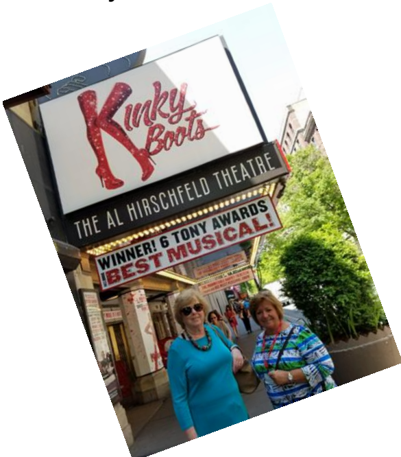
Billy Porter in Kinky Boots, NYC, May 2017