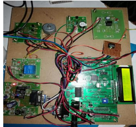
Fig.2: Temperature or gas sensor activated.