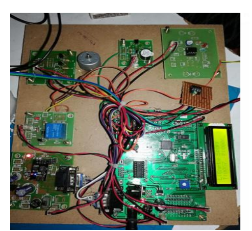
Fig.2: Temperature or gas sensor activated.