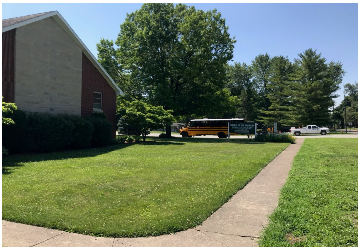
Wabash City Schools delivering lunches

We welcome all who are on the journey to know Jesus, who share in his love and who choose to embrace the diversity within this community of believers. As individuals we may be at different places along the path, but as a community, we are all traveling together in faith, trusting God to show us the way.