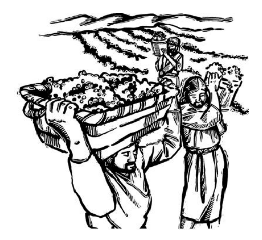
Copyright © Sermons4Kids, Inc. May be reproduced for Ministry Use