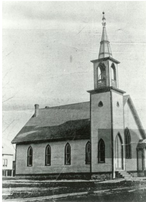
First Building, 1872

As we seek to follow the way of Jesus, we welcome all people to fully participate in our fellowship: all ages, colors, backgrounds, political affiliations, and physical and mental abilities; male and female, gay and straight, rich and poor, single and married. We are all God's children, and all are welcome here.