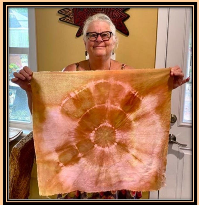
Saturday Oct. 23