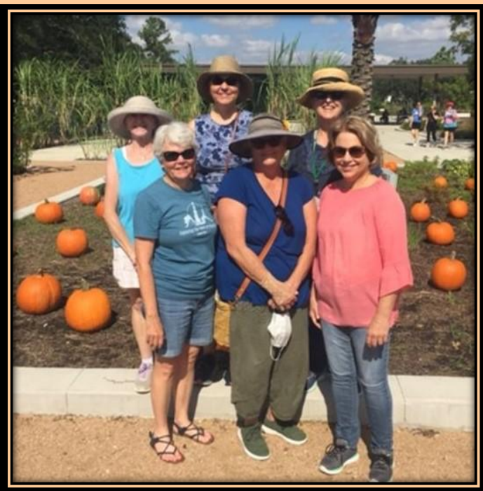
Saturday Oct. 9

Raw silk dyed with pokeberry and an iron mordant at the Houston Botanic Garden's Botanical Dyeing Class