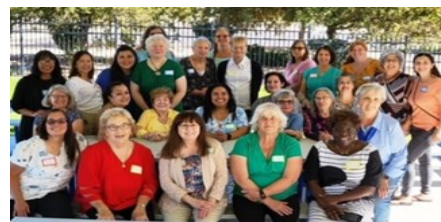
St. Andrew’s Women’s Society Meet & Greet