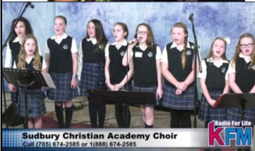
Sudbury Christian Academy Choir Call (705) 674-2585 or 1(888) 674-2585