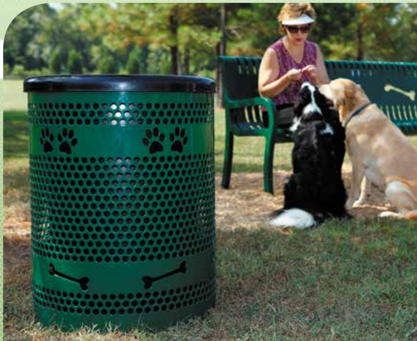
Shown with FTR-32-08 Lid (7lbs) and PL-32 Liner(8lbs), Sold Separately

No surfacing is specifically required; however we recommend mulch to prevent weed growth and protect high traffic areas from puddling. Contact your BarkPark™ representative for more information and a quote.