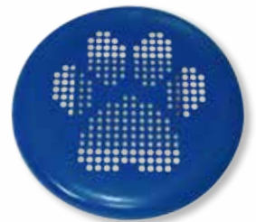
Stepping Surface Detail