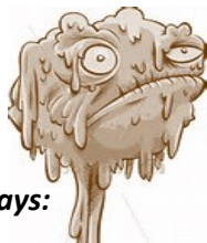
Robby Rock Snot says:

"Plan now to take a walk to see the 2018 Poster Contest Wall of Fame ".