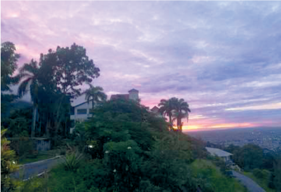
Sunrise at Mount St Benedict